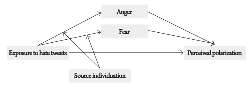
Figure 1. The Hypothesized Model

H3: Source individuation will moderate the effects of hate tweets on perceived polarization through decreases in (a) anger and (b) fear.