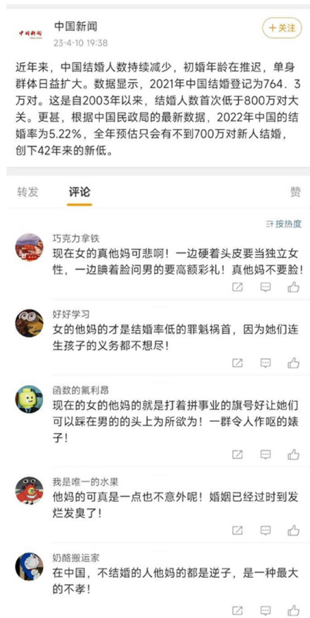
Figure 1. Example of Stimuli (Aggressive Comments against Women)

in China, which was adapted from social media posts published by news organizations. Regardless of their condition, participants read the same post from the news organization. Participants then read comments from different Weibo users presented in a social media post format. Depending on the condition to which they were assigned, they received different types of comments. All posts and comments were in Chinese, and the profile pictures and names of all user accounts were gender neutral.